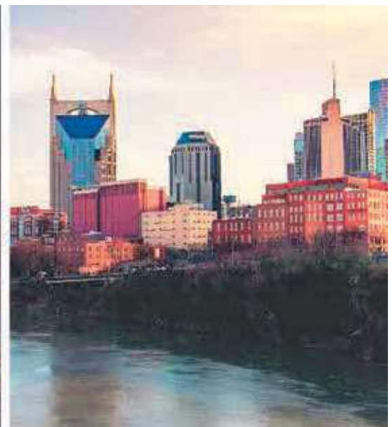
Left: Broadway Street in downtown Nashville | Right: Skyline